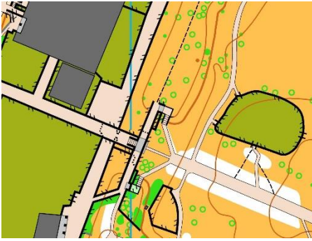
Actual map scale