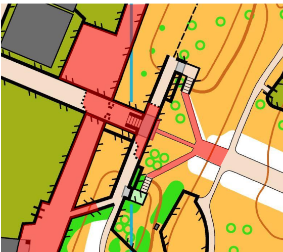
Lower Level shaded red (enlarged map)